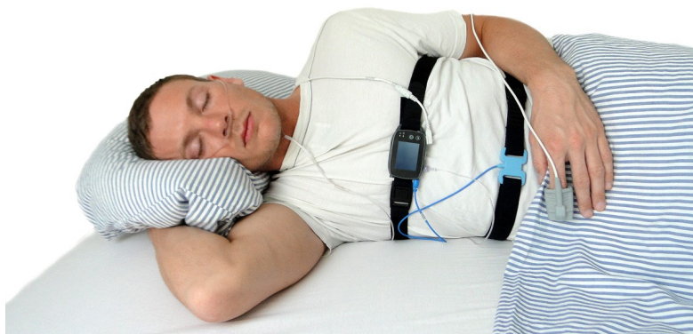
SOMNOtouch RESP Adult—Add PLM and ECG if required