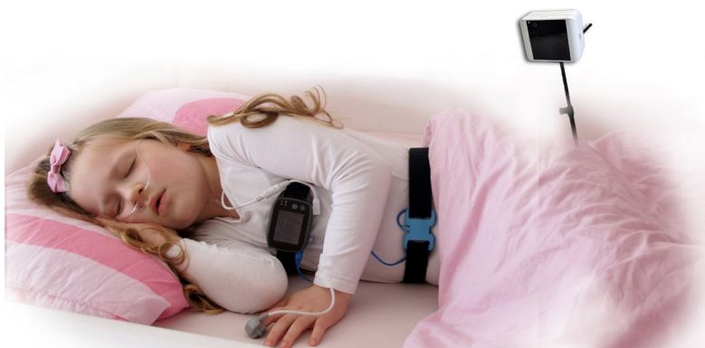
SOMNOtouch RESP Paediatric with or without Home Sleep Camera

The COVID-19 pandemic is having a massive influence on the ability of many sleep departments to maintain services in the face of unprecedented demand. As staff are rightly tasked to deal with direct consequences of the virus, assisting in direct patient care and support as required, there is inevitably a significant backlog of 'usual services' building in the background.